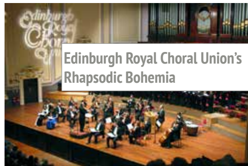
Edinburgh Royal Choral Union's Rhapsodic Bohemia

In March, ERCU continues its 'European Grand Tour' with a programme of music from Bohemia. After the warmth of Italy in November's concert, their spring programme includes very different mass settings by Antonin Dvorak and Leos Janacek, two giants of Czech music. Dvorak's charming Mass in D major was composed for consecration of a new chapel in the Bohemian countryside and its intimate scale and organ accompaniment make it a perfect pairing for Janacek's Mass in E flat: both composers' works reveal a rustic simplicity and an innate gift for gorgeous melody.