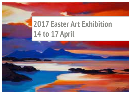
2017 Easter Art Exhibition 14 to 17 April

Sunday 5 March, 6pm | St Mary's Church, Haddington Tickets £5-15 on the door or in advance from tickets@ercu.org.uk for further information: www.ercu.org.uk | e:info@ercu.org.uk