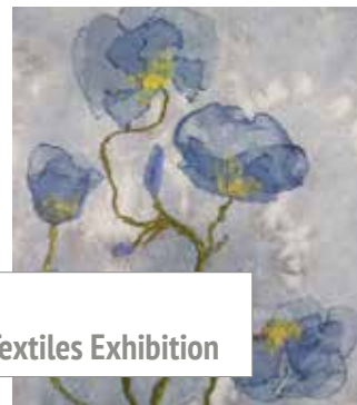
Organic Lines Group Twelve Textiles Exhibition